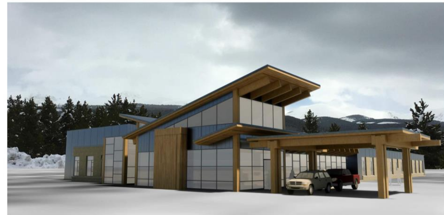
SOUTH WEST VIEW